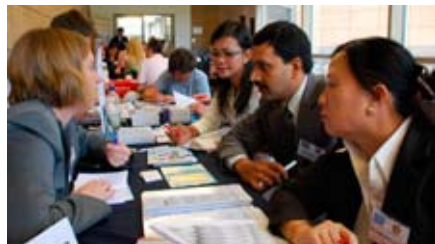
Speed-dating with publishers, 2012 General Assembly

Our central negotiations and licensing work also results in significant efficiency gains across the network – for example, in terms of time and legal fees.