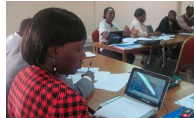
Participants at a three-day national FOSS workshop in Uganda

More than 1,750 librarians and end-users attended training sessions organized by our partner countries in order to increase awareness of FOSS tools designed to solve the challenges libraries – and their users – are facing.