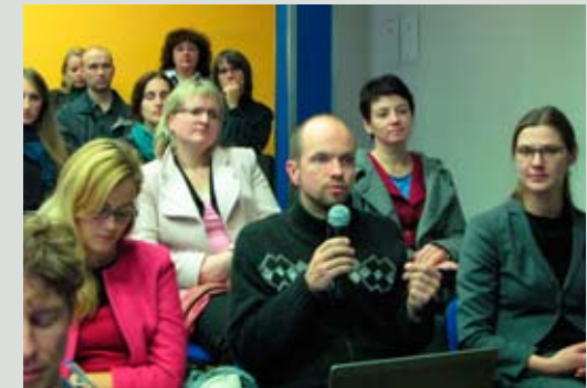
Young researchers in Lithuania discuss copyright, Creative Commons licences and OA publishing

“We welcome the fact that, as a result of the project, young researchers have become knowledgeable and effective advocates for OA, and are now key stakeholders in the new national OA Working Group.”